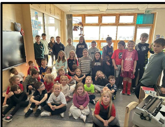
P1 with their P7 Buddies