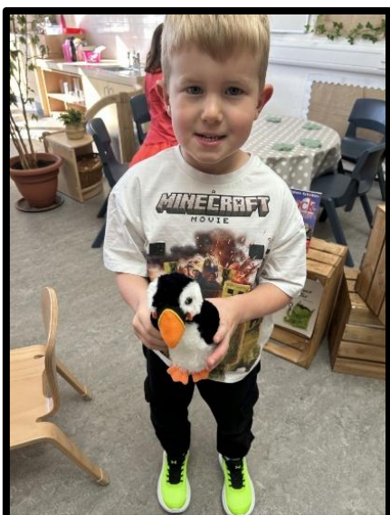
May our Motivated Puffin

All of the children are settling well into Primary One and are becoming very familiar with our rules and routines and we wish to celebrate their successful first term in school! Well Done everyone!