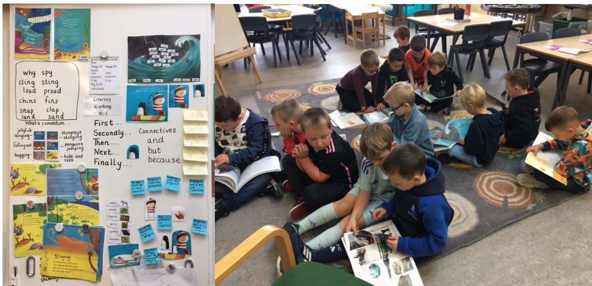
P2 do love a good book!