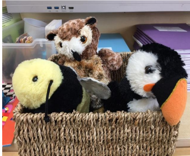
Our basket of Learning Behaviour friends!