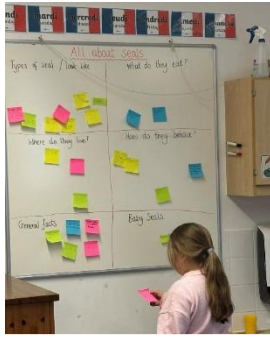
Ayla working on our whole class literacy research task