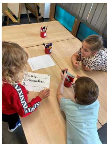
One of our topic teams thinking about the ways we use the sea