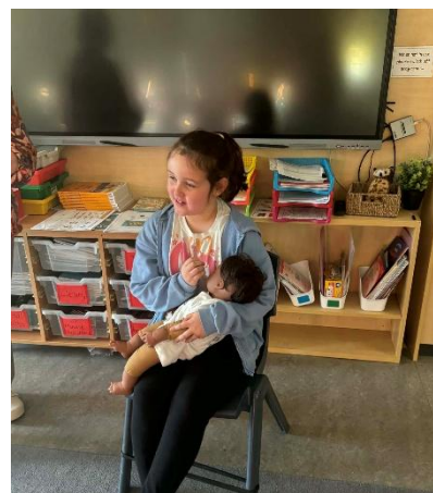
Albany demonstrating ways to soothe a baby