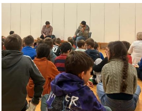
Norwegian violinists performed for us.