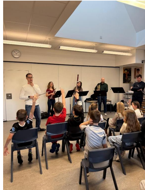
Wind Quintet performance.