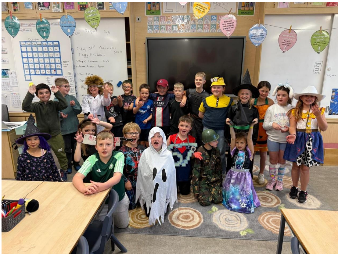
P4/5 dressed for Halloween