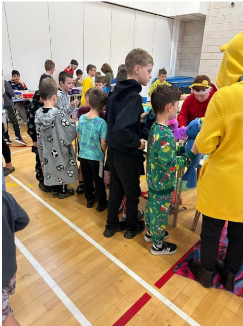
Children in Need bric-a-brac sale and activities in