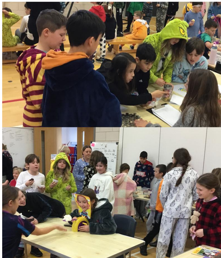
P6 enjoying a range of activities put on by the P7's to raise money for Children in Need.