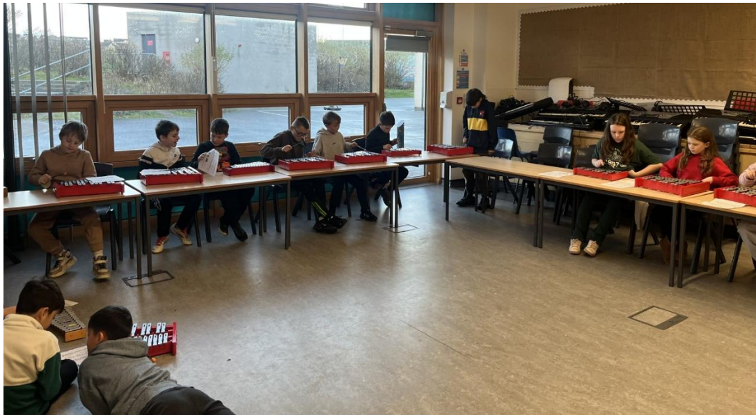
P6 practising their music reading and listening skills to play Jingle Bells on the glockenspiels.